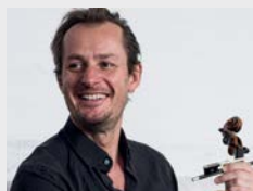
Richard Tognetti Director and Violin

The musicians on stage for this performance.